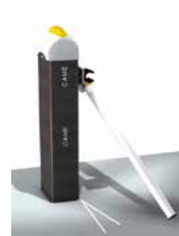
G40402 PLUS, detaching, boom fastener. After impact, the detached boom turns 90° and the end rests onto the ground.